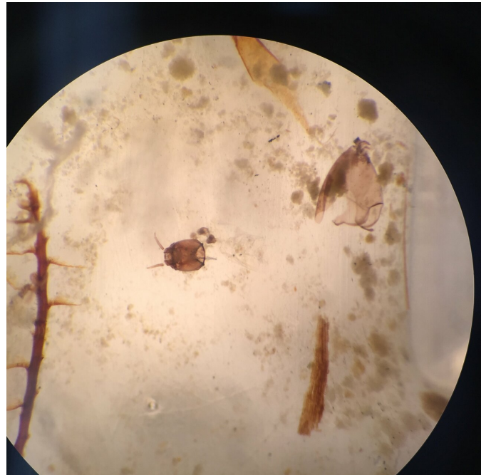
An up-close look at a chironomid's head capsule(center) under a microscope. The Northwestern team isolates these exoskeletons from sediment cores collected in southern Greenland for oxygen isotope analysis.

phase for multiple Medieval centuries as had been hypothesized. (When the NAO is in its positive phase, it brings cold air to much of Greenland.)