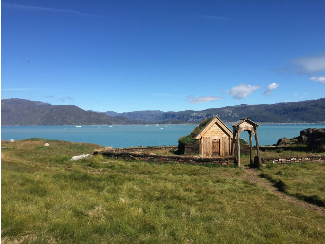
This is a 21st-century reproduction of Thjodhild's church on Erik the Red's estate (known as Brattahlíð) in present day Qassiarsuk, Greenland.

A new study may resolve an old debate about how tough the Vikings actually were.